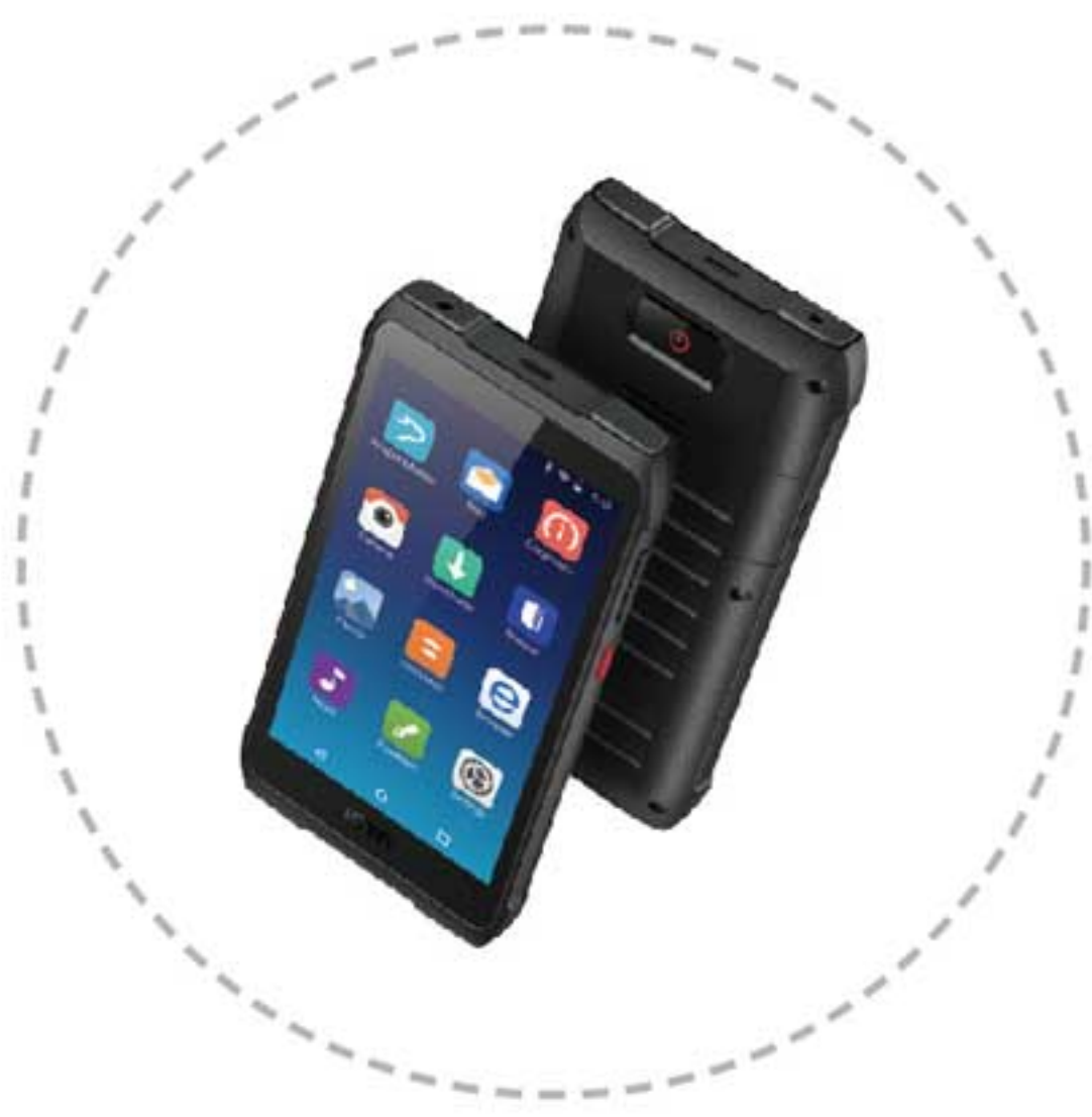
Anti-fall design strong and durable