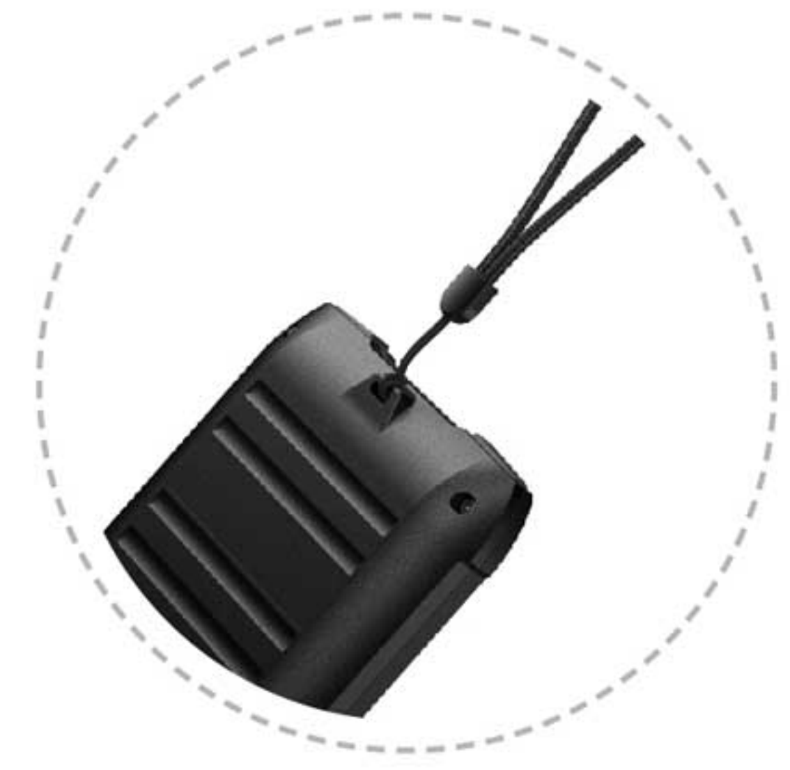
Lanyard design easy to carry