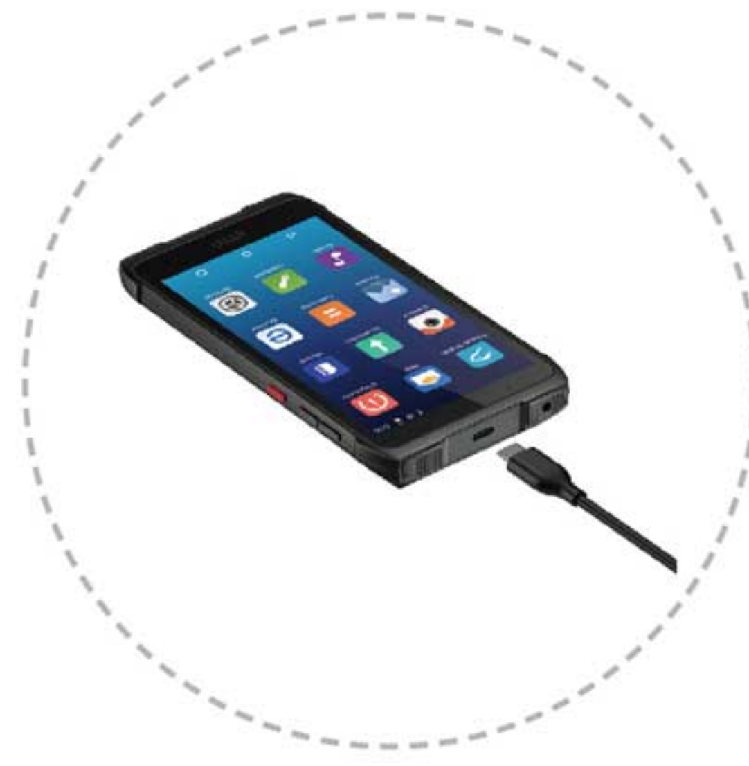
Type-C interface positive and negative insertable